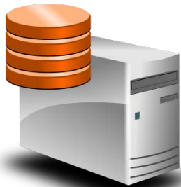
AID Secure FTP Server

"20161101_83470_BCBS_Provider_Type_NPI_AddDelete.csv"