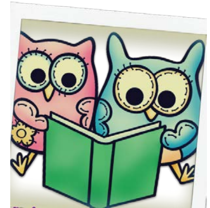
Blue Cross Experts

"20161101_83470_BCBS_Provider_Type_NPI_AddDelete.csv"